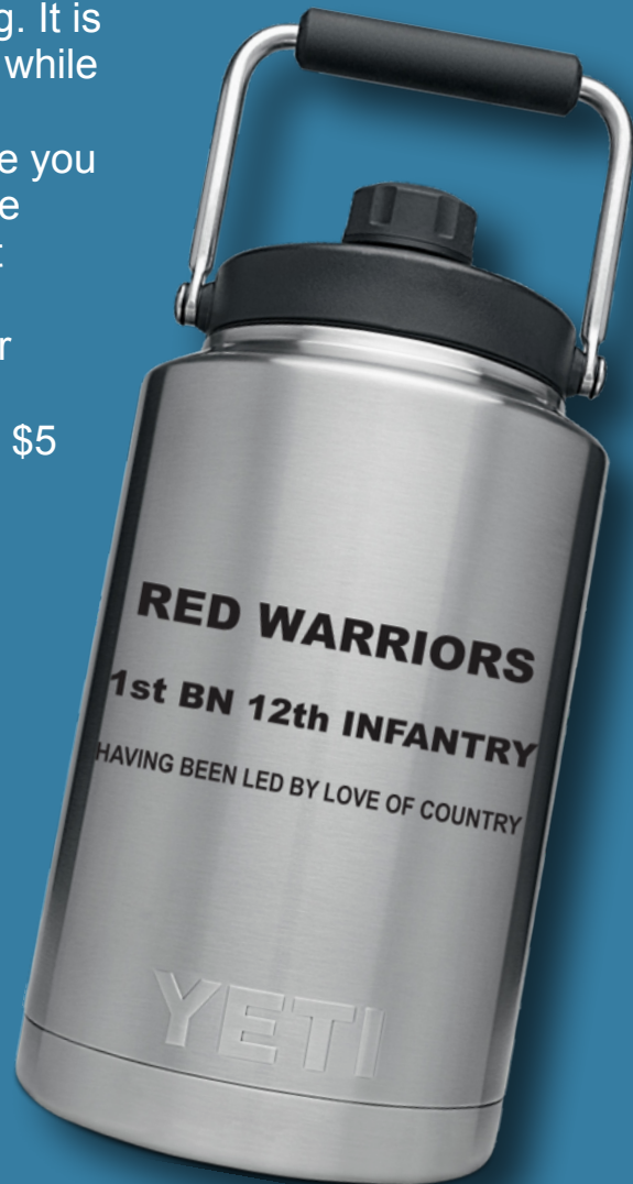
One-Gallon YETTI mug with 12 th Regiment Motto/Dr Pepper Logo